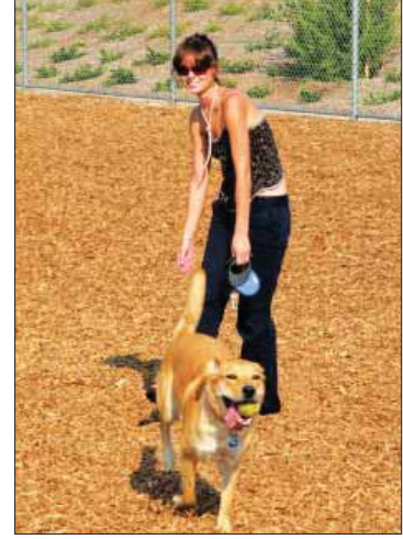
FREEDOM: L.A. dog owners have bought into the city's agreement to allow them and their dogs to have access to Airport Park's dog area.

If usage patterns at the park change and grow to a point where the annual fee for